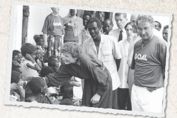
MARY ROBINSON SEES FIRST-HAND THE EFFECT OF THE FAMINE IN SOMALIA IN 1992

And what about the first GOAL Jersey Day in 1988? Perhaps you were wearing your favourite sports top that day. Now, 37 years later, the event has raised over €5 million, and we owe it all to people like you.