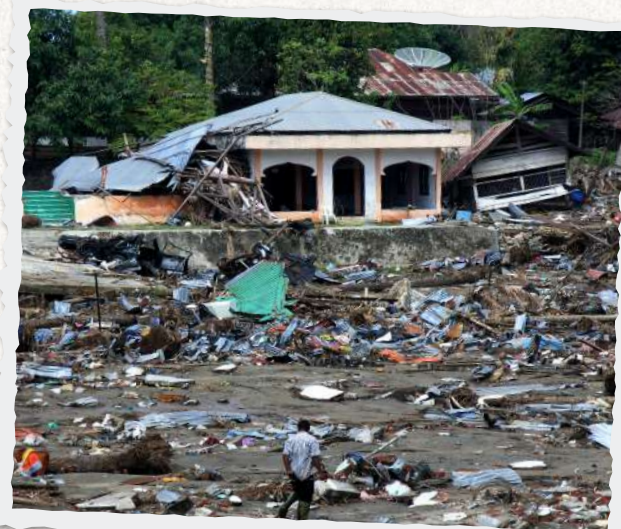
A TSUNAMI IN SOUTH-EAST ASIA IN 2004 LED TO ONE OF GOAL'S LARGEST RESPONSE PROGRAMMES SO FAR.

Since then, GOAL has become synonymous with the phrase 'first in and last out' - reflecting our proudly won reputation for being both agile first responders and continuing to work alongside communities, empowering them to rebuild what was lost. And the support of people like you means we never have to leave until our job is done.