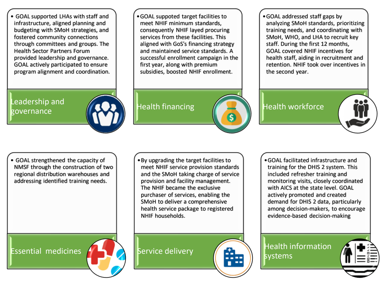
Figure 1: Interventions implemented by GOAL under the six Systems Building Blocks