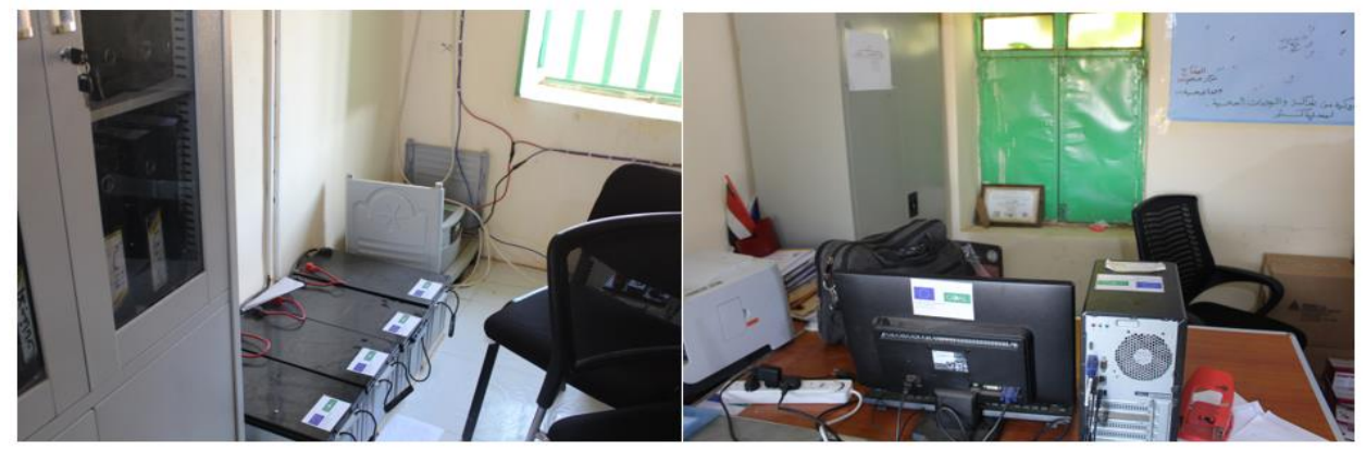
Figure 3: Kutum LHD was renovated and equipped by the HealthPro project

At midterm/endline, all the 3 LHDs had adequate operational LHD office space, equipment, and furniture and had functional locality health management teams. This has enabled the LHDs to implement activities related to EPI, Reproductive health, Nutrition and DHIS support supervision.