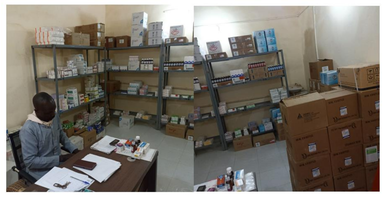
Figure 4: A well-organized store in a facility supported by HealthPro in Umbaru

At the midterm/endline, at least one health worker had been trained from each of the ten targeted health facilities. In addition to the three-day standard NMSF training, NHIF provided on-the-job training to pharmacy staff in the facilities on documentation relevant to claims processing for insurance subscribers during a joint stakeholder supervision visit in December 2021. As a result, all the facilities had organized pharmacies and up-to-date stock cards.