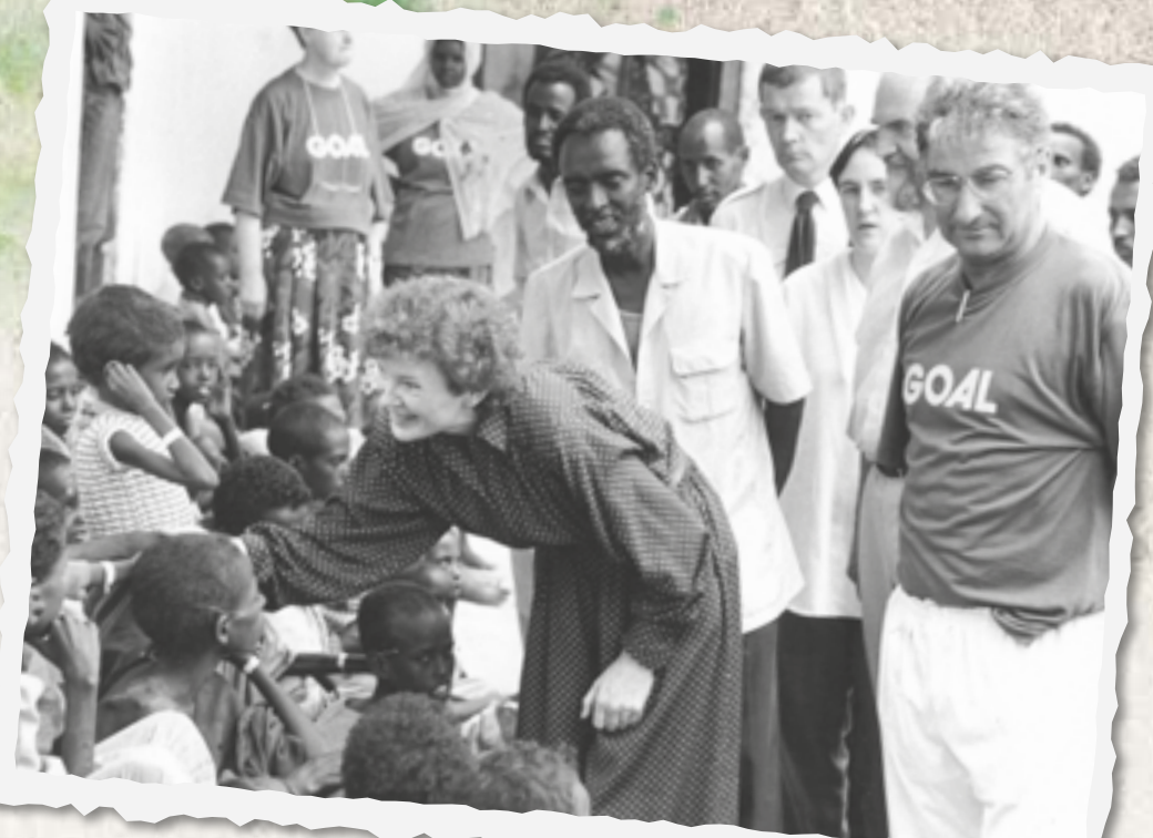
Mary Robinson sees first-hand the effect of the famine in Somalia in 1992