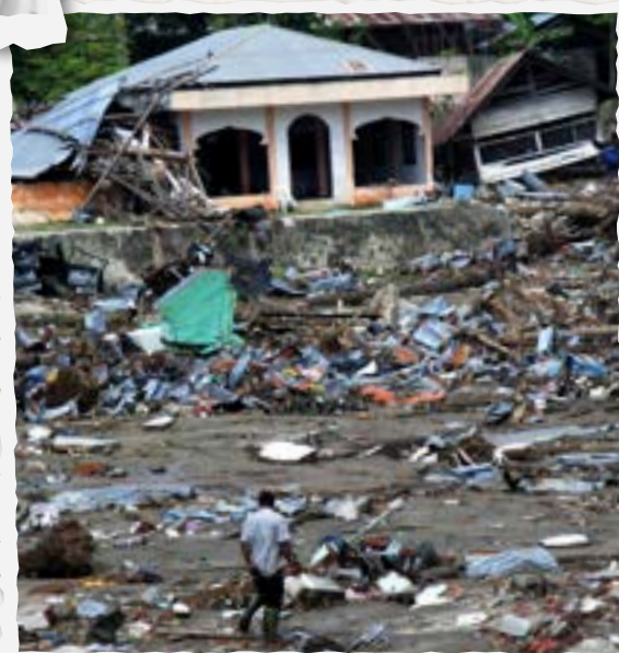
A tsunami in South-East Asia in 2004 led to one of GOAL's largest response programmes so far.

Since then, GOAL has become synonymous with the phrase 'first in and last out' – reflecting our proudly won reputation for being both agile first responders and continuing to work alongside communities, empowering them to rebuild what was lost. And the support of people like you means we never have to leave until our job is done.