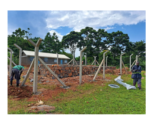
Construction underway on the Molumbi Borehole storage tanks and gravity feed for 800-900 beneficiaries. Image taken June 2023.